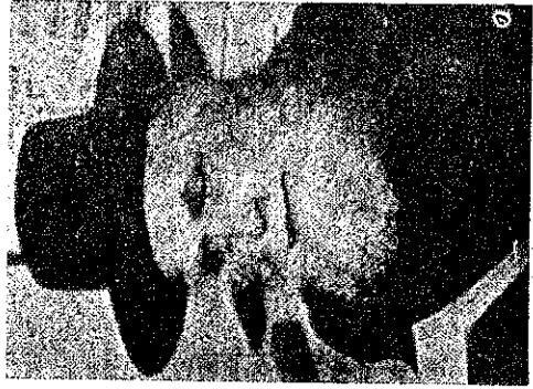
Rabbi Akiva Sofer "Rav of Pressburg"