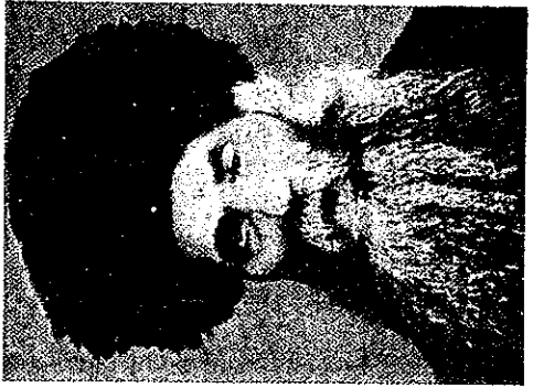
Rabbi Isser Zalman Meltzer