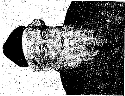
Rabbi Yitzchok Zev Soloveitchik, the 'Brisker Rov'.