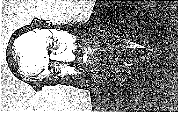
Rabbi Michael Ber Weissmandel

When Rabbi Michael Dov approached the time to leave this world and return his soul to the treasury where the martyred souls of his tortured holy brethren repose, he quickly compiled the notes which were to form his book, "Min HaMaitzar" ("From the Depths"). It was published posthumously by the Nitra Yeshiva, which he had established in the United States. Bewailing the agonies of the people, as in the Book of Lamentations, as the prosecutor who has an irrevocable warrant, as an historian who writes a memorial, and as the represen-